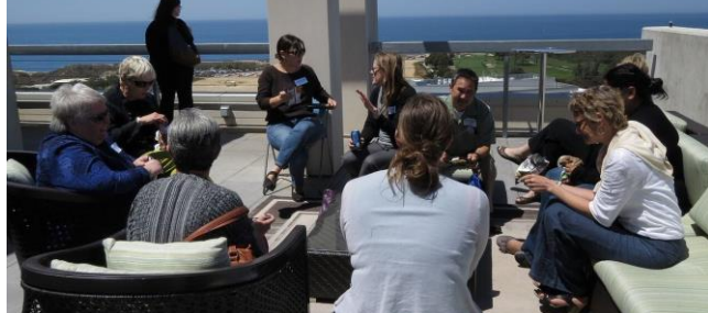
Assembly attendees enjoy lunch on the patio outside The Village building, overlooking the Pacific Ocean and Torrey Pines golf course.