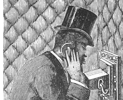
"Welcome to ReadyTalk"

A discussion of this magnitude required additional time outside of the Annual Assembly in the form of special assemblies conducted virtually through conference calls. Scheduling two-hour meetings for 28 delegates was a monumental task! It was achieved, however, with two assemblies scheduled in the two weeks leading up to the Annual Assembly in San Diego. These special assemblies featured vigorous discussion on fundamental issues surrounding the purpose and composition of LAUC, as well as the text of proposed revisions.