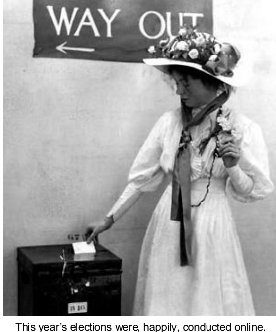
This year's elections were, happily, conducted online.

They will be forwarded to UCOP for final approval. There is no firm date for the membership, and the membership will be updated in future.