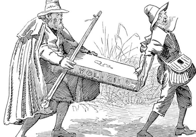
Have a big project in mind? Apply for a LAUC Research Grant this fall!