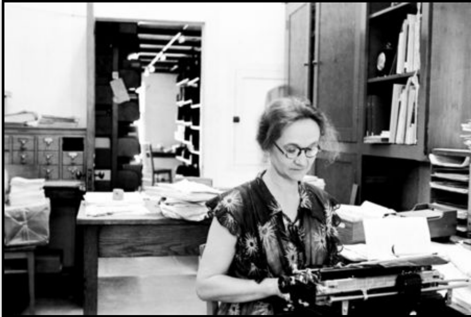
Eugene Cecil LaFond Papers. SMC 102. Special Collections & Archives, UC San Diego. https://library.ucsd.edu/dc/object/bb14686259