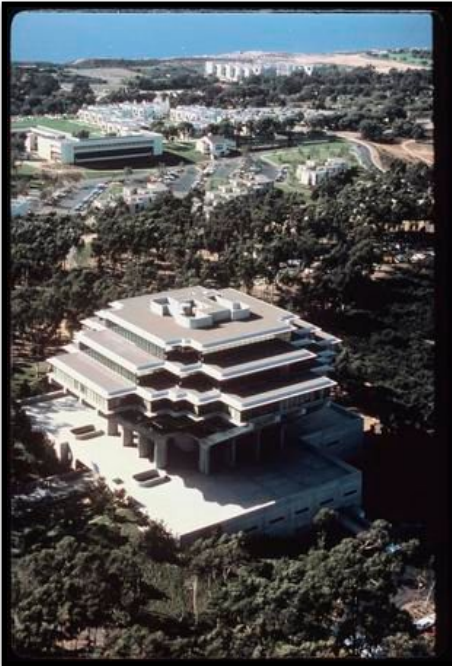
Geisel Library, 1981